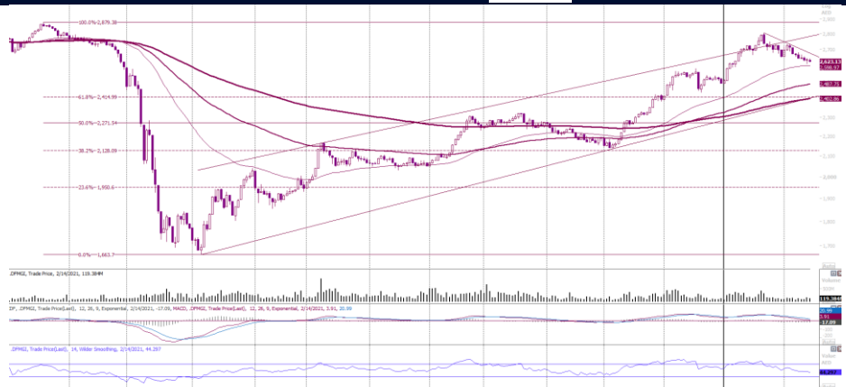
DFM GENERAL INDEX – DAILY CHART