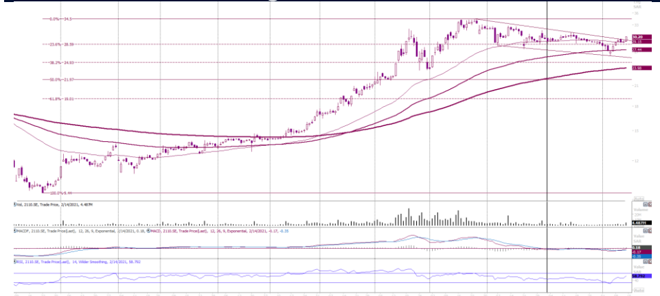
Aseer Trading Tourism – DAILY CHART

The Index has been corrective in its movement but remains above its two of its three major moving averages. We remain positive on the Index, and we await a reversal against the correction.