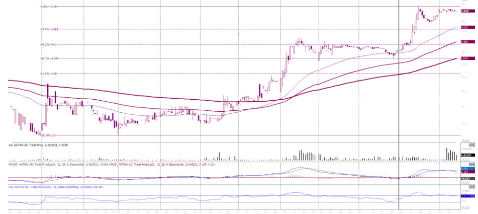
Agthia Group - DAILY CHART

The Index continued with its uptick and reached its highest levels since late 2005; that is a great feat. The trend remains up and we suggest take advantage of any dips against the uptrend.