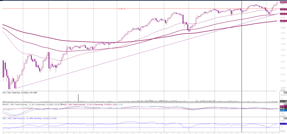
TADAWUL ALL-SHARE INDEX – DAILY CHART