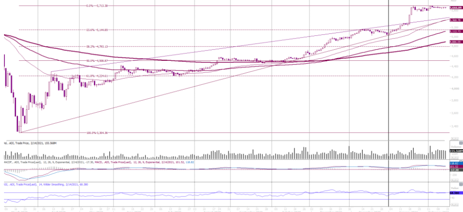
ADX GENERAL INDEX - DAILY CHART