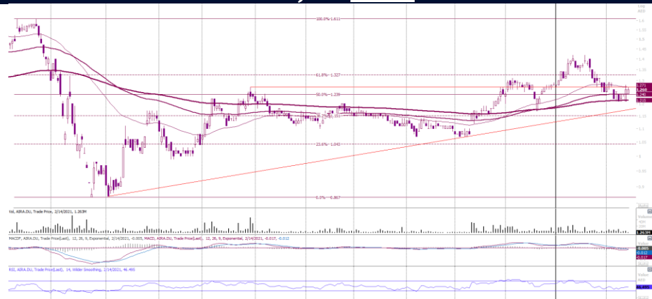
Air Arabia PJSC – DAILY CHART

The Index has been in a correction and is expected to weaken further in the short term.