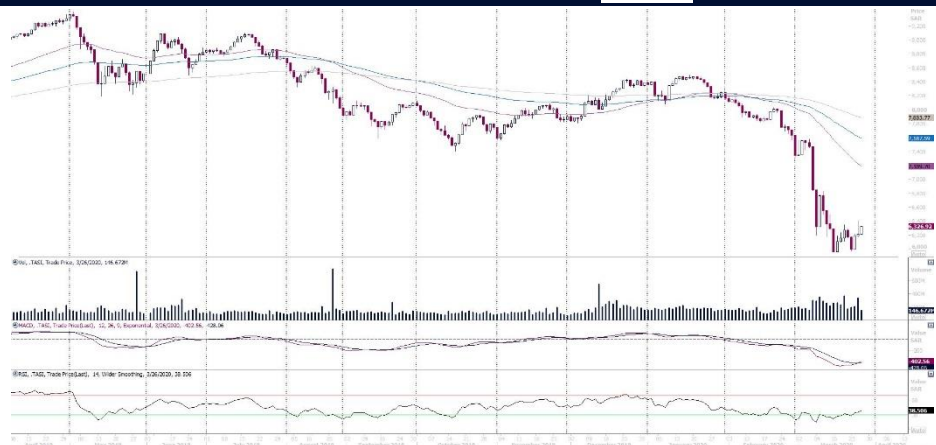
TADAWUL ALL-SHARE INDEX - DAILY CHART