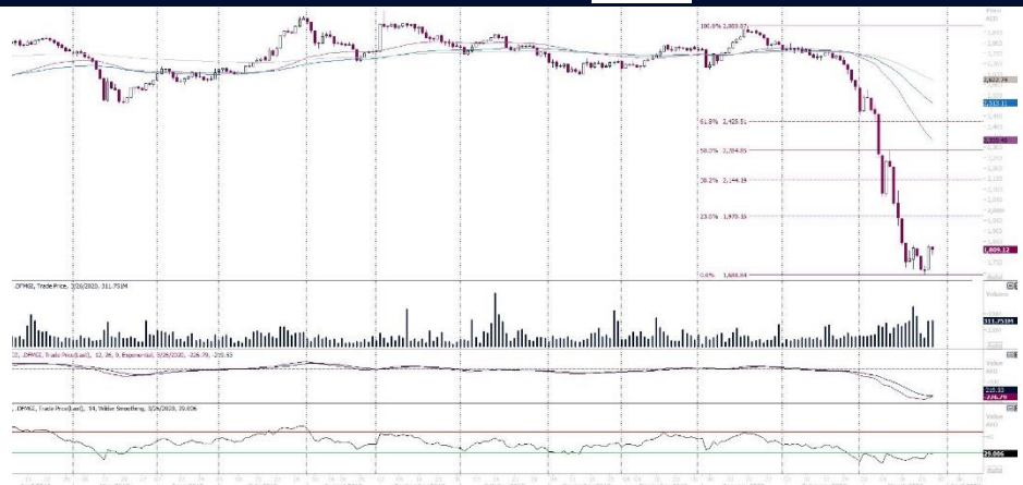
DFM GENERAL INDEX – DAILY CHART