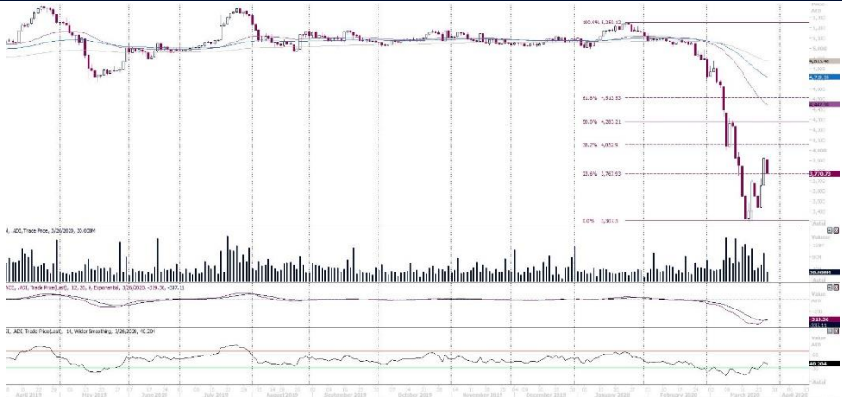
ADX GENERAL INDEX - DAILY CHART