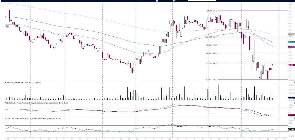
Halwani Brothers Company - DAILY CHART

The Index has created, arguably, a double-bottom formation; it is a bullish reversal pattern in the short term (once confirmed).