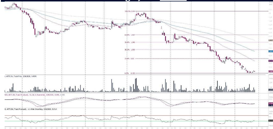
Arabtec Holding PJSC – DAILY CHART

The trend remains down, and the Index reached multi-year levels. However, indicators show extreme levels have been reached.