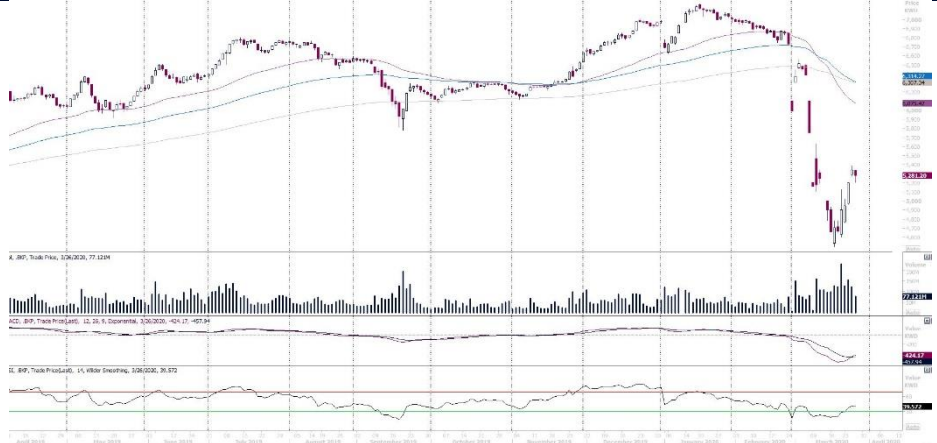
KWSE PREMIER MARKET – DAILY CHART