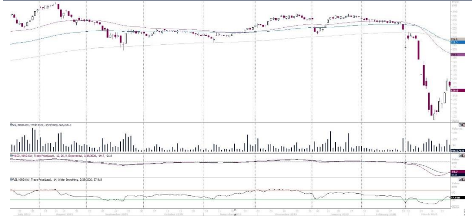
National Industries Group Holding – DAILY CHART

The Index has been in a V-shaped correction; the correction maybe over.