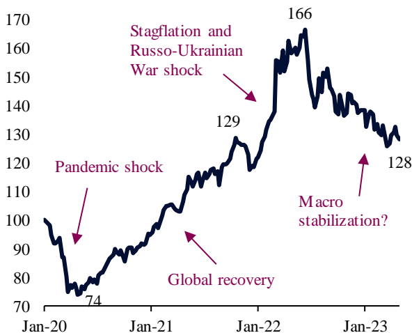
Bloomberg Commodity Index (normalized, January 2020 = 100)

First, commodity prices seem to indicate a further deceleration of the global economy. Higher policy rates, liquidity withdrawals, contained fiscal spending and inflation-driven lower disposable incomes are already moderating aggregate demand, producing a slow down in activity. This is expressed in the more pronounced correction of highly cyclical commodities, such as energy and base metals. Brent crude oil prices, while still slightly above pre-pandemic marks, are down 38% from their recent peak. Copper and lumber prices, important proxies for activity in China and the US, have also collapsed from their recent peaks. Such price performance suggests that the global growth outlook is still dominated by headwinds and the ongoing deceleration in the US and Europe.